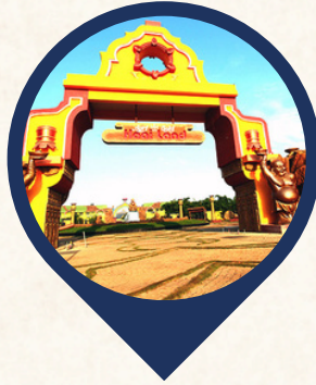
Haailand Amusement Park Mangalagiri (15km)