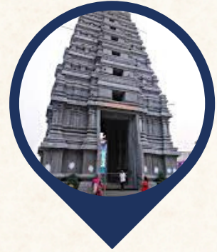
Amaralingeswara Swamy Temple Amaravati (25km)