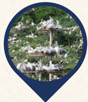
Uppalapadu Bird Sanctuary Guntur (15km)