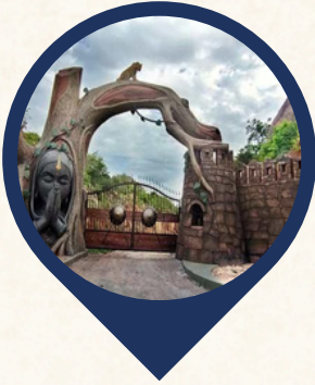
Kondaveedu Fort Kondaveedu (30km)