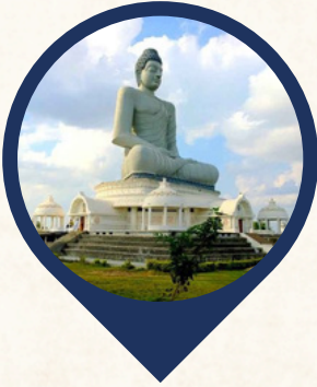
Dhyana Buddha statue Amaravati (25km)