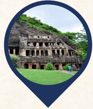
Undavalli Caves Undavalli (40km)