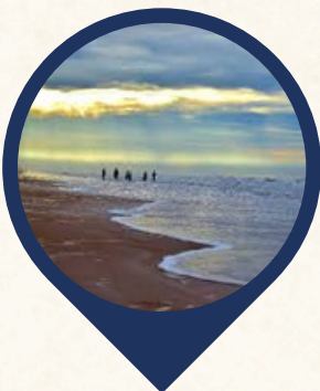
Suryalanka Beach Bapatla (50km)