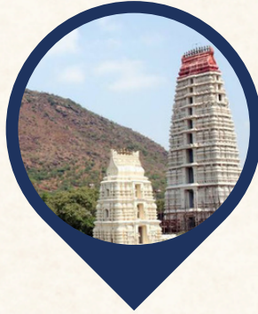
Panakala swamy temple Mangalagiri (30km)